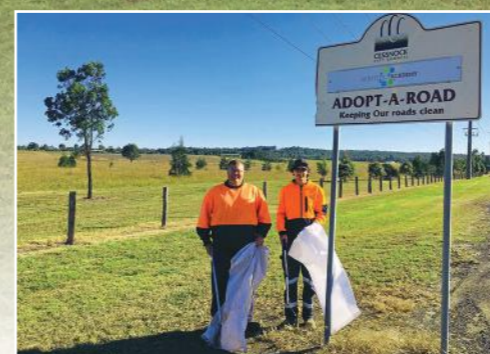
📌 Adopt-A-Road program